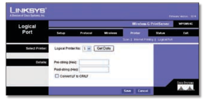
Printer > Logical Port

The PrintServer has three logical or virtual printer ports. For example, you can have three different configurations for your printer: Logical Printer 1 for landscape orientation, Logical Printer 2 for double-sided copies, and Logical Printer 3 for manual feed. Map Logical Printers 1, 2, and 3 to the physical printer on the PrintServer's USB port.